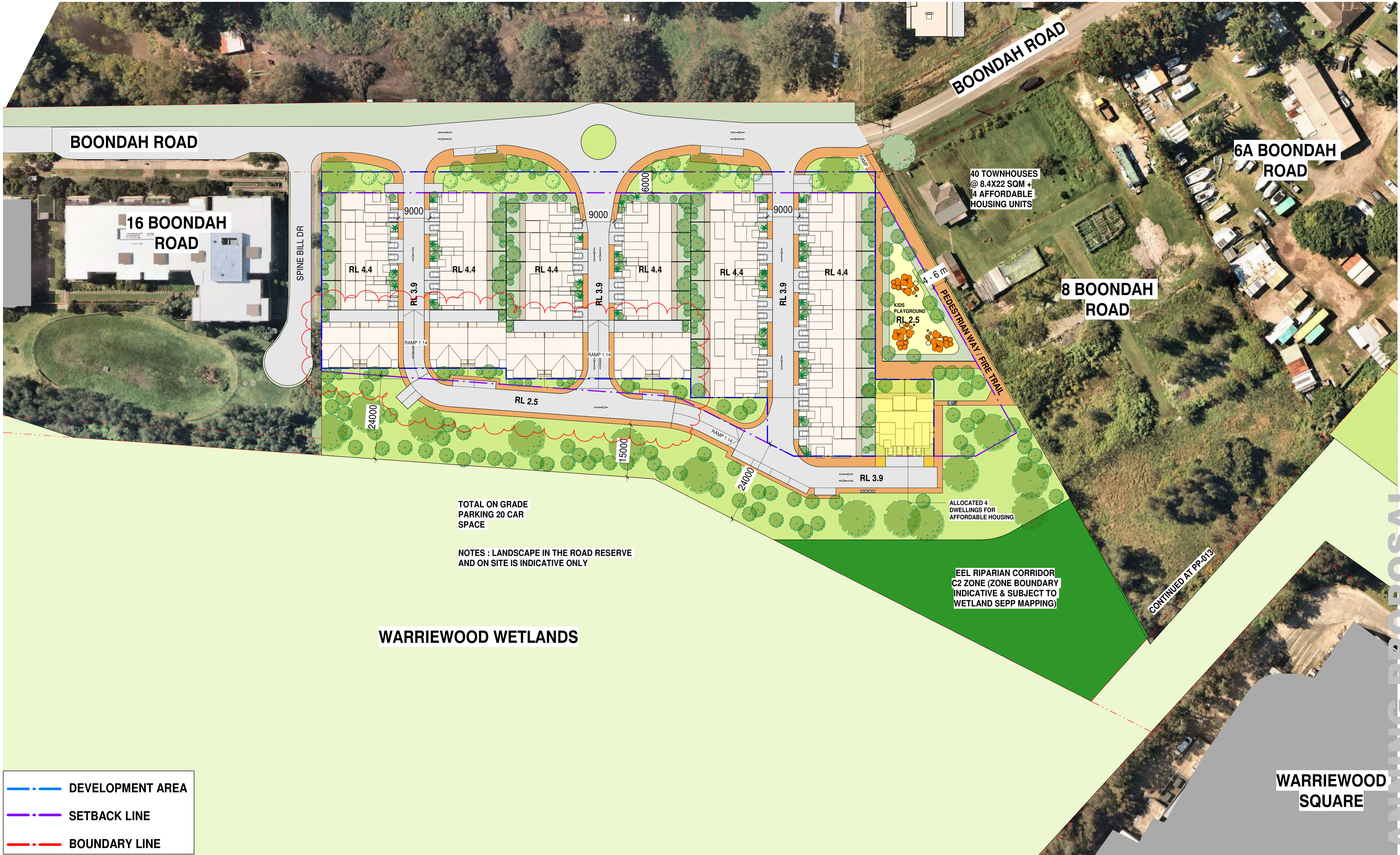
Site Plan SCALE 1 : 500

Project WARRIEWOOD 10 Boondah Rd, Warriewood, New South Wales 2102